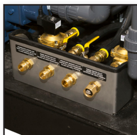
Hose connectors are clearly marked and designed for easy accessibility and quick installation