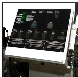
CSA listed NEMA-4 rated corrosion-proof control panel for safe and reliable operation