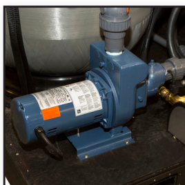
Pumps are easily accessible